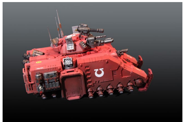
Tom Flaherty: 28mm (~1:64 scale) Warhammer Primaris Repulsor WIP (Games Workshop)

Tom writes: "New techniques: color modulation using airbrush; airbrushing/hand-painting Tamiya clear acrylics over Vallejo Model Air acrylics."