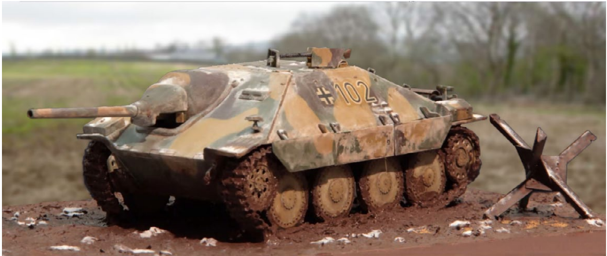
Tom Flaherty: 1:35 scale Sd.Kfz. 138/2 "Hetzer" Early Version (Dragon)

Tom used 1mm wide masking tape to create wood strip effect on propeller; he also used a light coat of Tamiya Clear Orange over the propeller to give it a more varnished look.