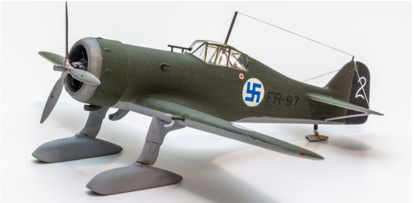
Ora Lassila: 1:72 scale Fokker D.XXI (MPM)

Ora writes: "The Fokker D.XXI is a classic pre-war Dutch fighter aircraft. It first flew in 1936, and subsequently served with Dutch, Danish and Finnish air forces. Despite being somewhat outdated by the outbreak of World War 2, the type achieved much success with the Finnish Air Force. The model represents an aircraft flown by the Finnish ace Lt. Jorma Sarvanto. His claim to fame is that on January 6th, 1940, he encountered a formation of DB-3 bombers and proceeded to shoot down six of them in 4 minutes, thus becoming an "ace-in-a-mission!"