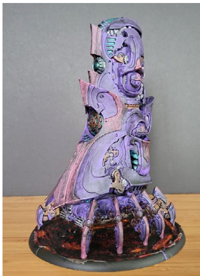
Transfinite Emergence Projector