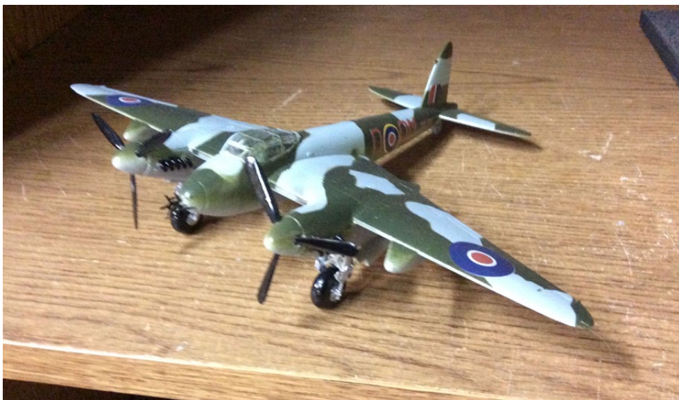
Bart Navarro: DeHavilland Mosquito