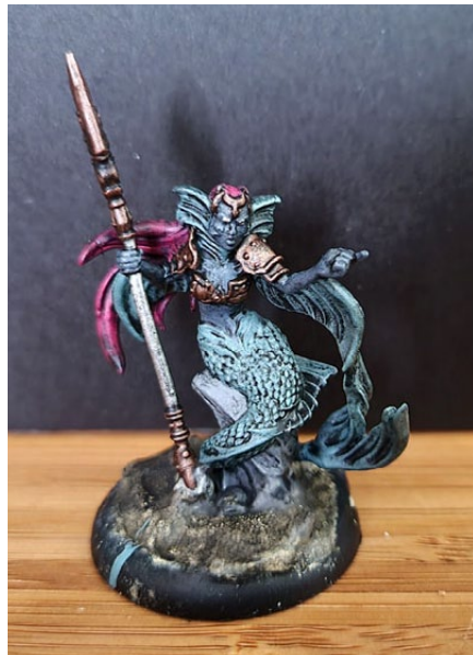
Fiona of the Black Lagoon