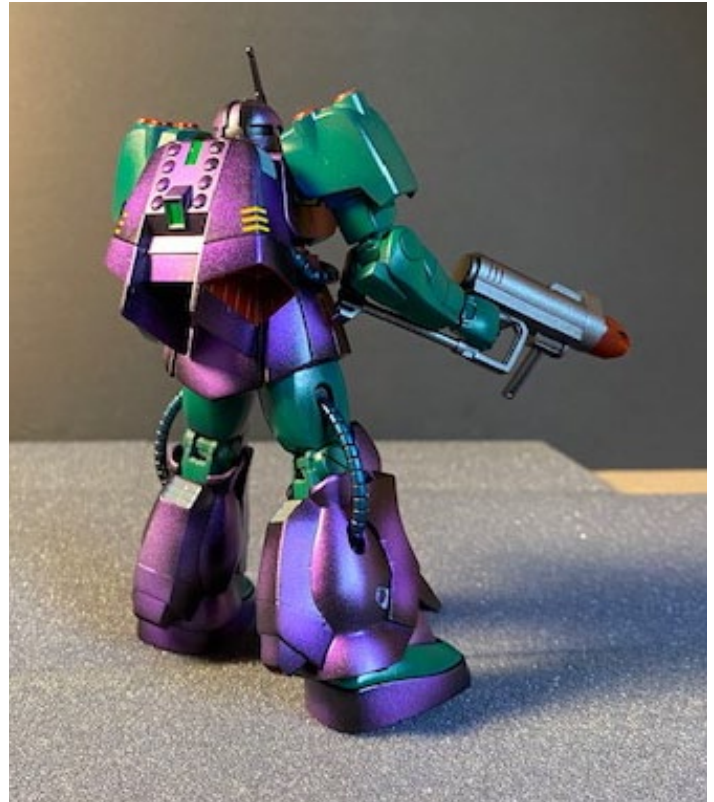
Thomas Warchal: 1:144 scale Zaku 2 Mariner RMS-192M Zeon amphibious suit (Bandai)

Tom writes: "I used Tamiya and Mr. color airbrushed paints to pre-shade both the base- and finish colors. On the blue-green parts I experimented with using a clear blue coat over the custom green I mixed to give those armor pieces more of a slight turquoise look. I used Mr. Hobby Gx series clear purple to achieve the deep purple candy areas, and then I used Tamiya clear blue to accent the power cables as a semi-candy type look."