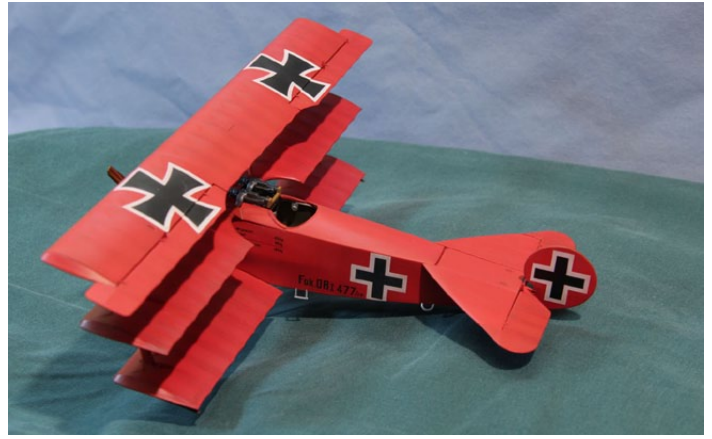
Tom Flaherty: 1:32 scale Fokker Dr.I (Roden)

Tom used 1mm wide masking tape to create wood strip effect on propeller; he also used a light coat of Tamiya Clear Orange over the propeller to give it a more varnished look.