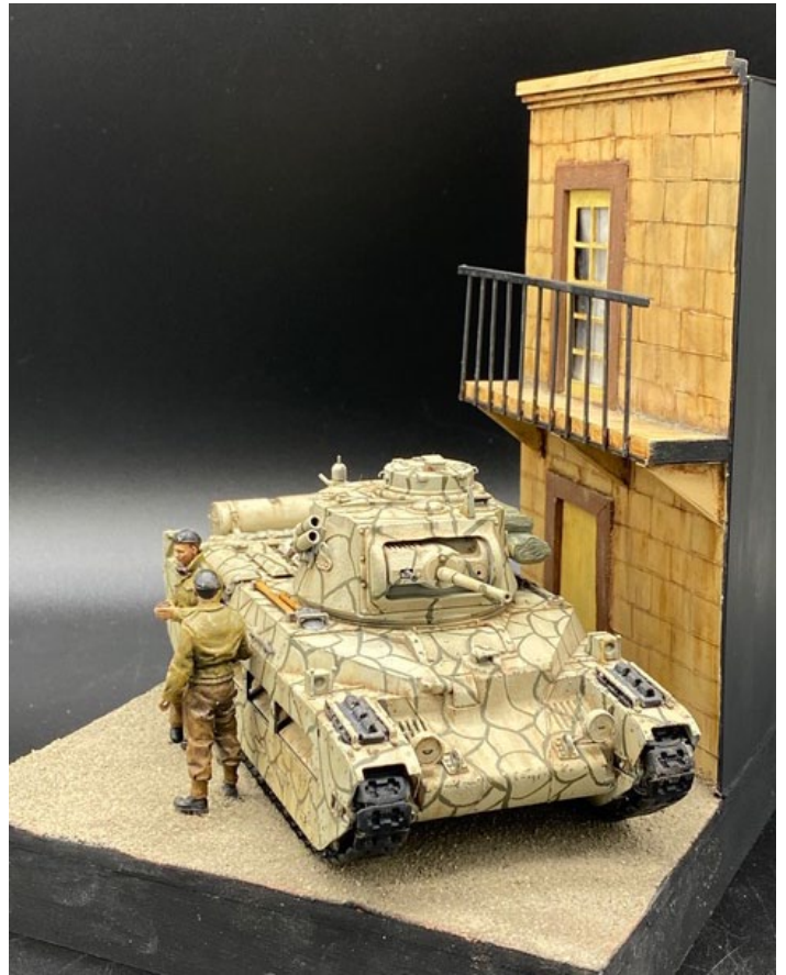
Mike O'Keefe: 1:35 scale Matilda tank diorama (Tamiya; figures from Panzerart)