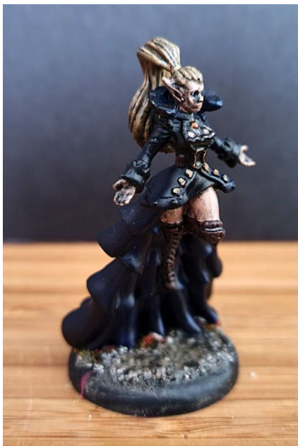
Issyria, Sybil of Dusk