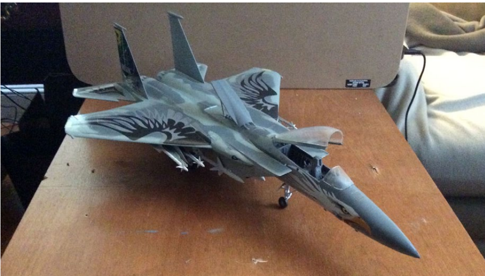
Bart Navarro: M-D F-15 Eagle