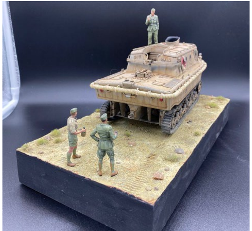
Mike O'Keefe: 1:35 scale Land Wasser Schlepper (Hobby Boss; figures from Panzerart)