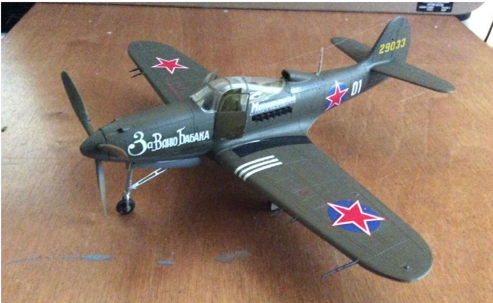
Bart Navarro: P-39 Aerocobra