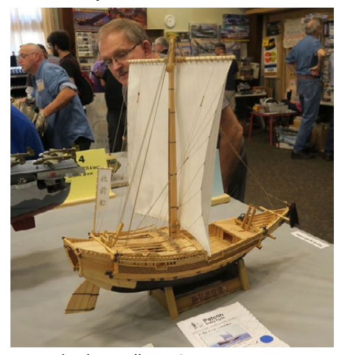
Michael Rumrill's 1:72 Japanese coaster