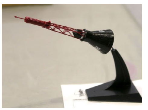
Bill Michaels's 1:72 Mercury capsule