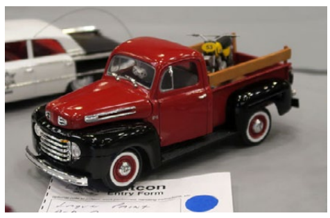
Ruane Crummett's Ford F-1