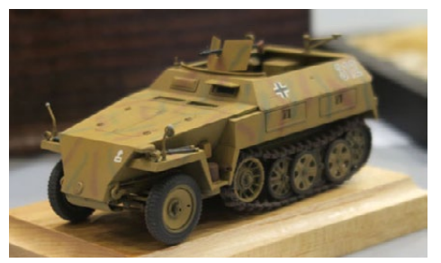
Joe Michaud's 1:35 St.Kfz. 250/1