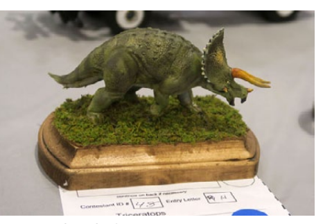
Al LaFleche's 1:48 Triceratops